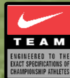
Larry Fitzgerald Arizona Cardinals