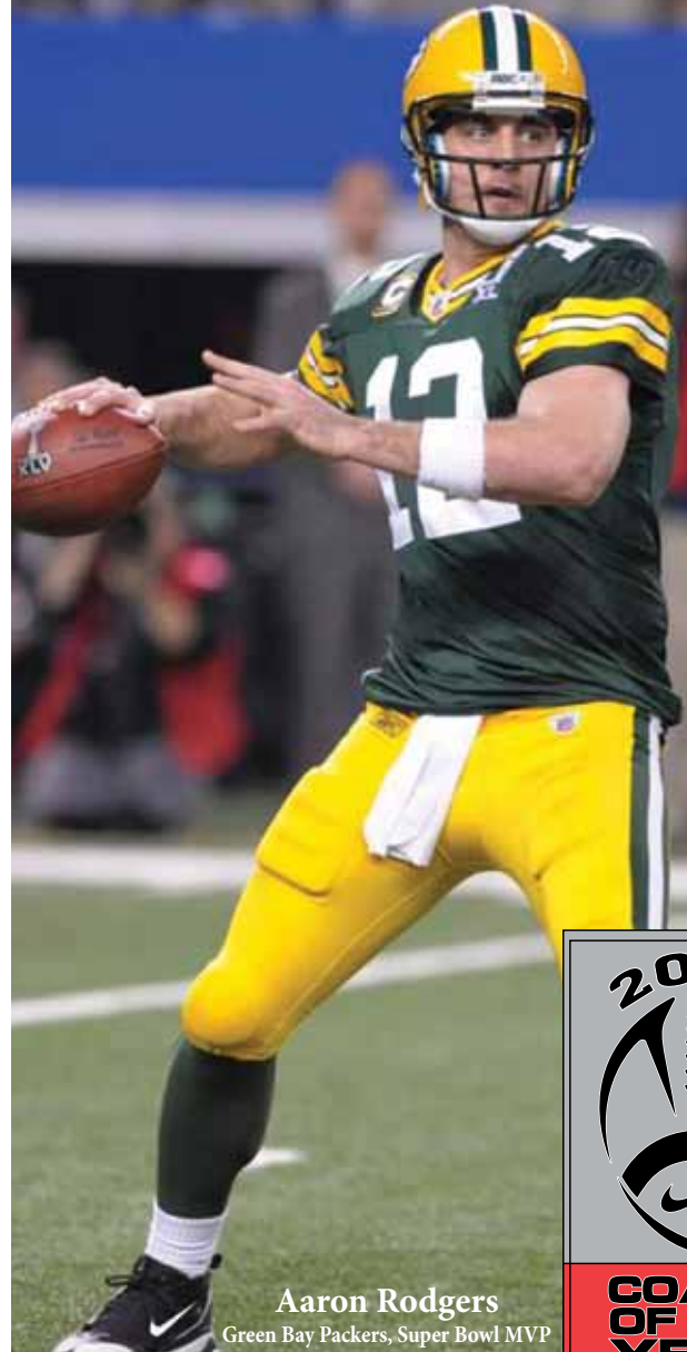
Aaron Rodgers Green Bay Packers, Super Bowl MVP

ROOM RATES: The Melville Marriott has guaranteed a Clinic Rate of $109.00 per night until January 3, 2012. After that rates are subject to availability. Call (631) 673-4324 for reservations.